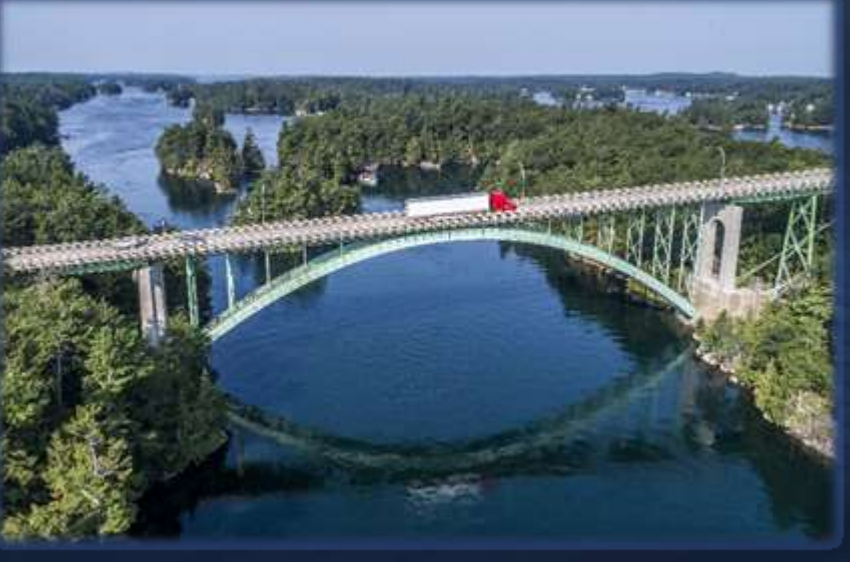
. AMALGAMATION- A CHANGE INFOCUS